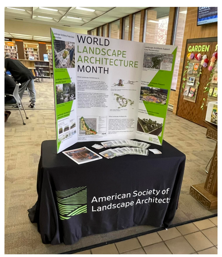
2023 WLAM display at the Pocatello Library

If you're looking for ways you as an individual can celebrate, advocate, and educate in your own community check out some great ideas from ASLA at asla.org/wlam2024. Another easy way to share your unique perspective is by joining the conversation on social media using the hashtag #WLAM2024.